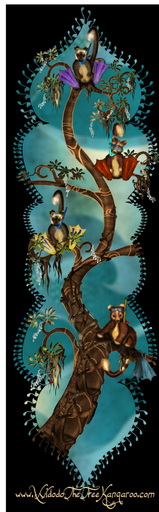
See how beautiful it is! That's me, down the bottom.